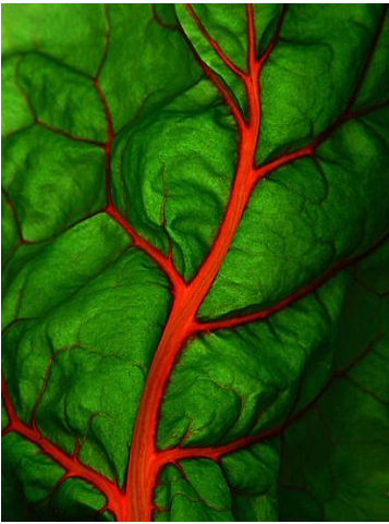
Continue planting silver beet for late summer picking

There is still much to do in the food garden. Continue planting beans, carrots, lettuce, silver beet and tomatoes for late summer crops.