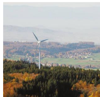
Freiamt in the Black Forest... making energy to burn and sell

German Sources: Der Spiegel 2007, Die Tageszeitung 2006, Giesener Anzeiger 2007